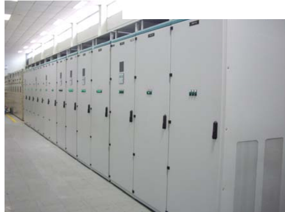
300 kvar, 400 V, 7 % Dynamic detuned PFC-systems for TR 26

Needless to say, ITM met all requirements set by SIW: