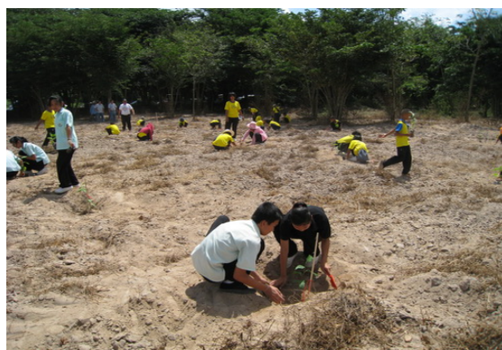
SIW for a better environment: Planting trees at Nong Plalai reservoir.

But SIW not only works with concrete – it also gets concrete! The company's vision is to fight against global warming. By running projects such as planting trees at Nong Plalai reservoir and dispensing with foam boxes and plastic bags, SIW has taken serious steps to save and protect the environment . And it has also decided to invest in power factor correction to significantly reduce the power consumption at its plants.