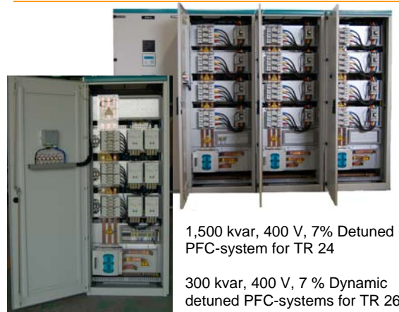
1,500 kvar, 400 V, 7% Detuned PFC-system for TR 24

The various components were assembled into panels by ITM.